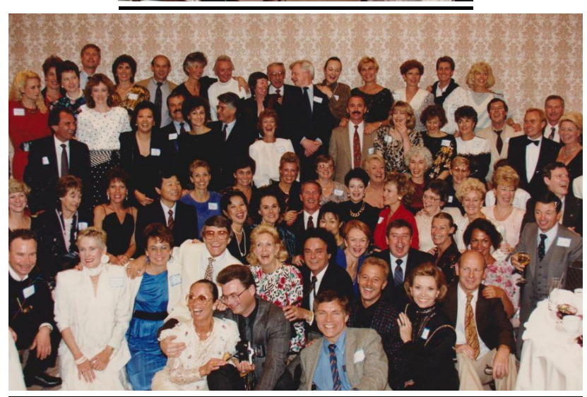
60<sup>th</sup> Reunion – Las Vegas