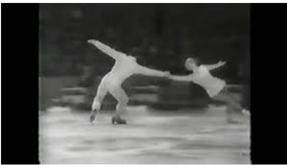
1968 World Championships - Pairs Free Skate - Ludmila Belousova & Oleg Protopopov URS