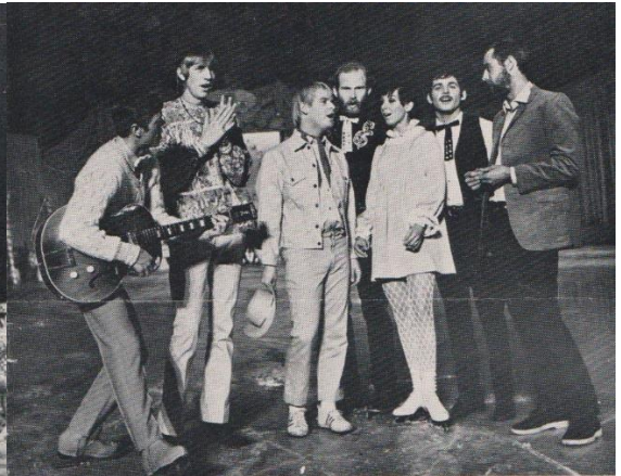
'Highlights of the Ice Capades 1969' with Louis Nye, Nancy Sinatra & Jack Jones