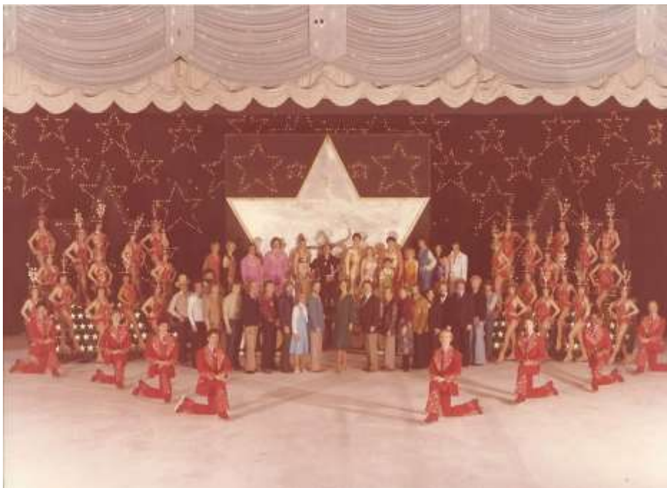
1978-79 East Co.