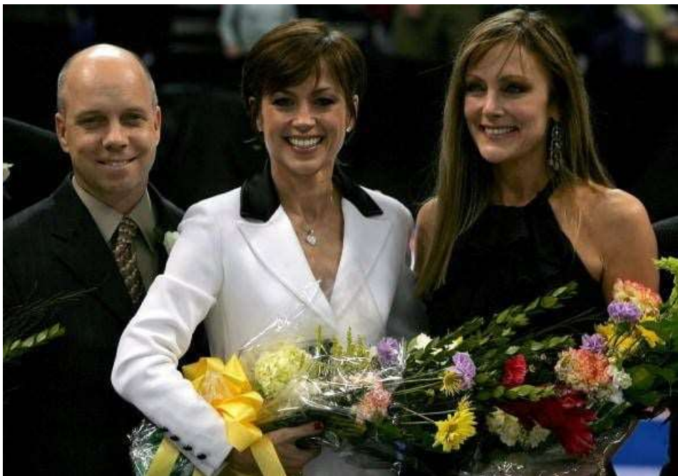
Figure Skaters' Favorites Cookbook Vol. II

ALL THREE of these US OLYMPIC CHAMPIONS have contributed recipes for Volume 2.