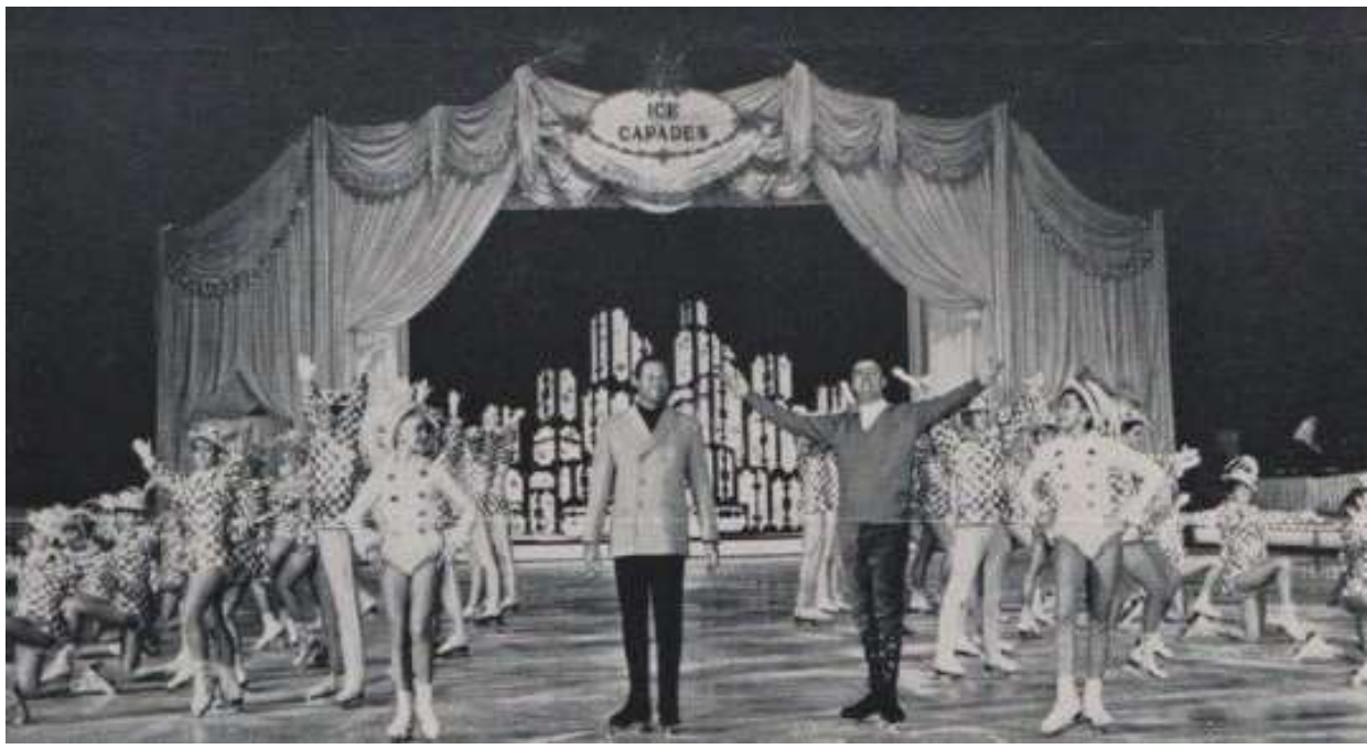
Dan Rowan and Dick Martin join in the fun as NBC presents the Ice Capades of 1968 as a color special.