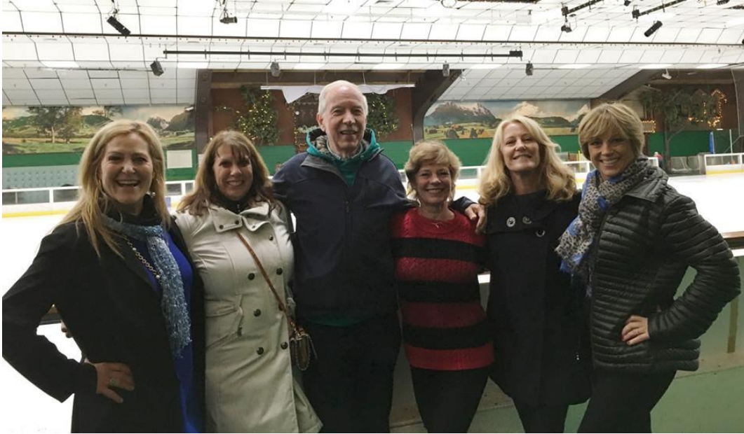
Mini reunion at Ice Dance International in San Jose.