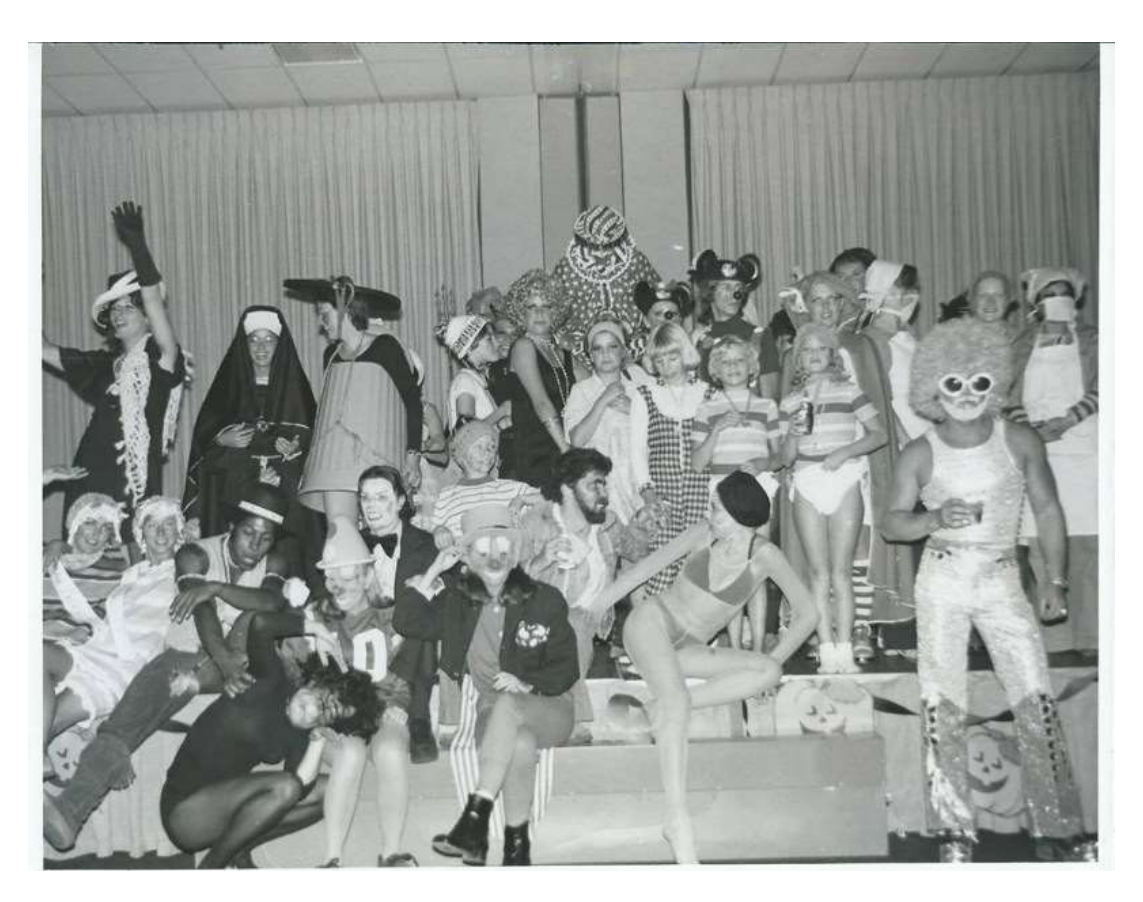
1974 Halloween West Co.