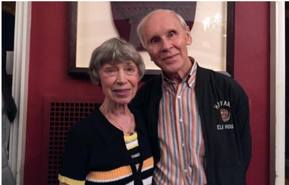
Ludmila and Oleg Protopopov are in their 60th year skating together. -Sherry Gao

Two-time Olympic gold medalists offer critique of modern pairs rules